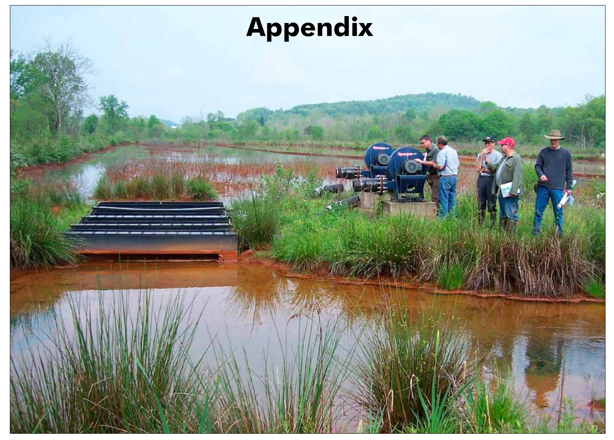
Brinkerton Treatment System, Westmoreland County