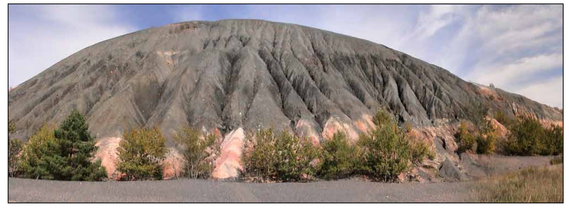
Nemacolin abandoned refuse pile