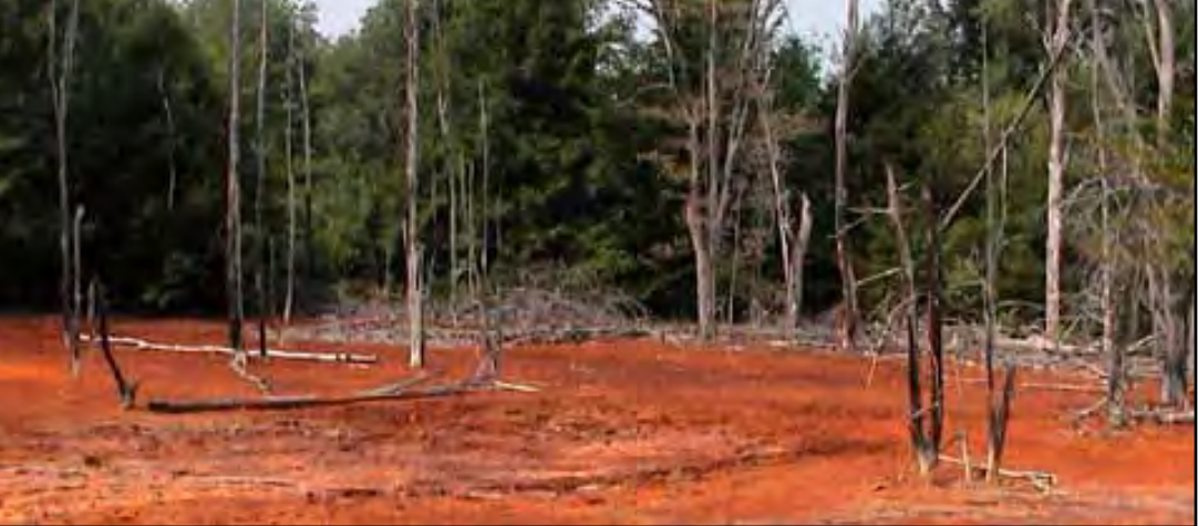
Nemacolin abandoned refuse pile