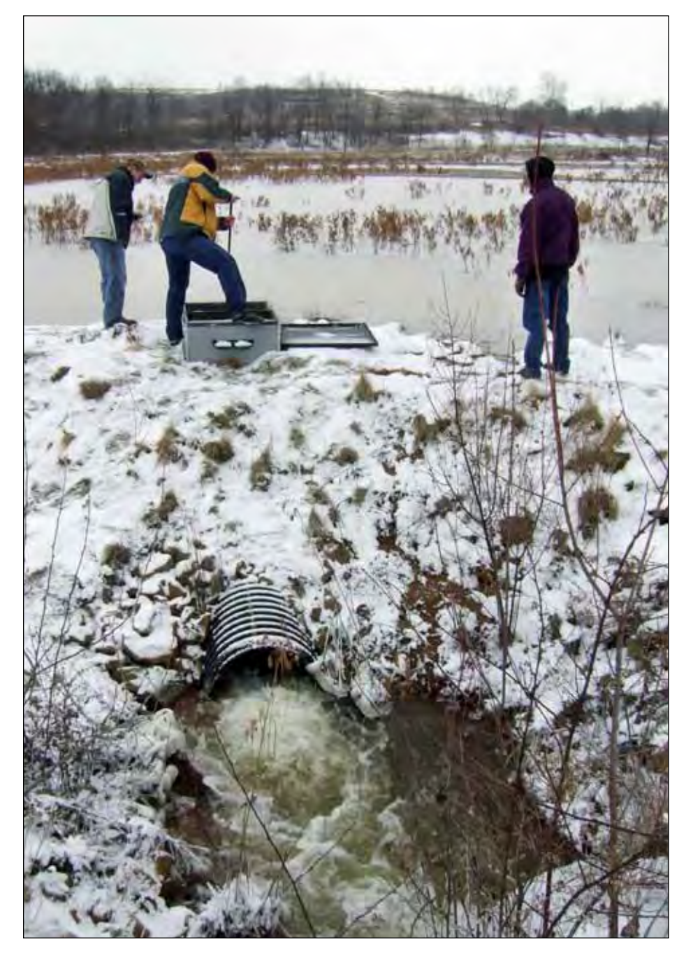
Adjusting the final flow control box where treated mine water from the Brinkerton Treatment System enters the Sewickley Creek in Westmoreland County.