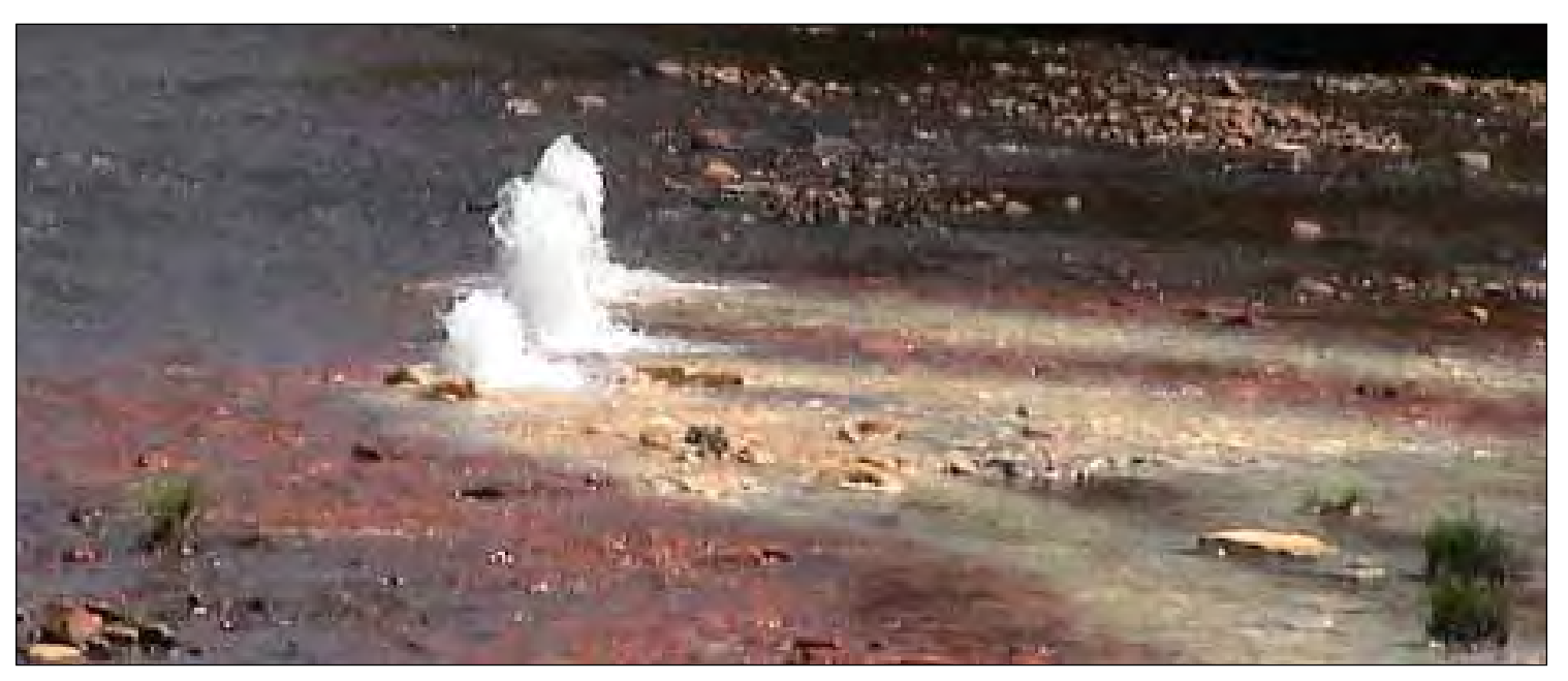
The Three Sisters mine water discharge in Blacklick Creek, Indiana County