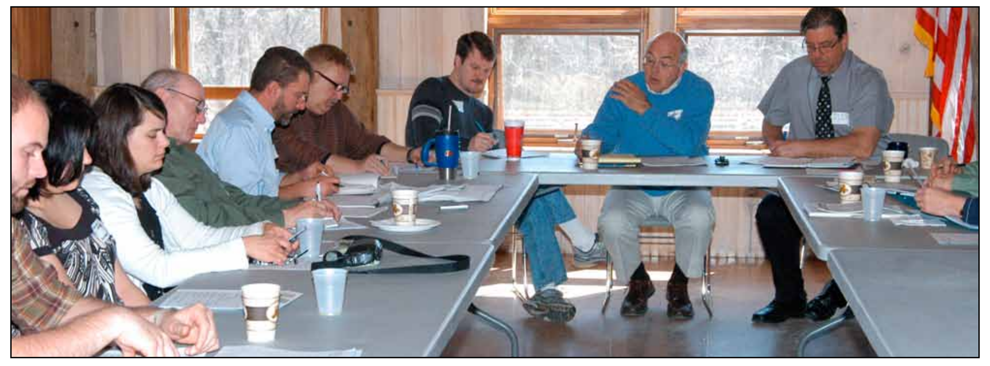
WPCAMR Board of Directors meeting with key stakeholders

repairs of Growing Greener eligible water restoration projects which includes passive treatment systems.