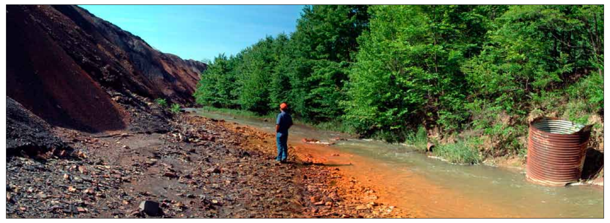
Barnes-Watkins Refuse Pile, Cambria County