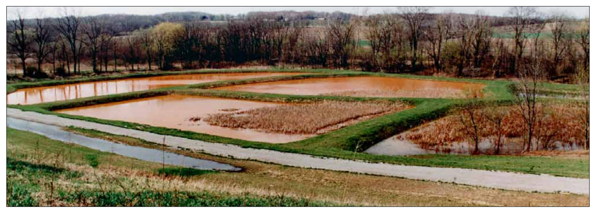
Saint Vincent passive treatment system near Latrobe