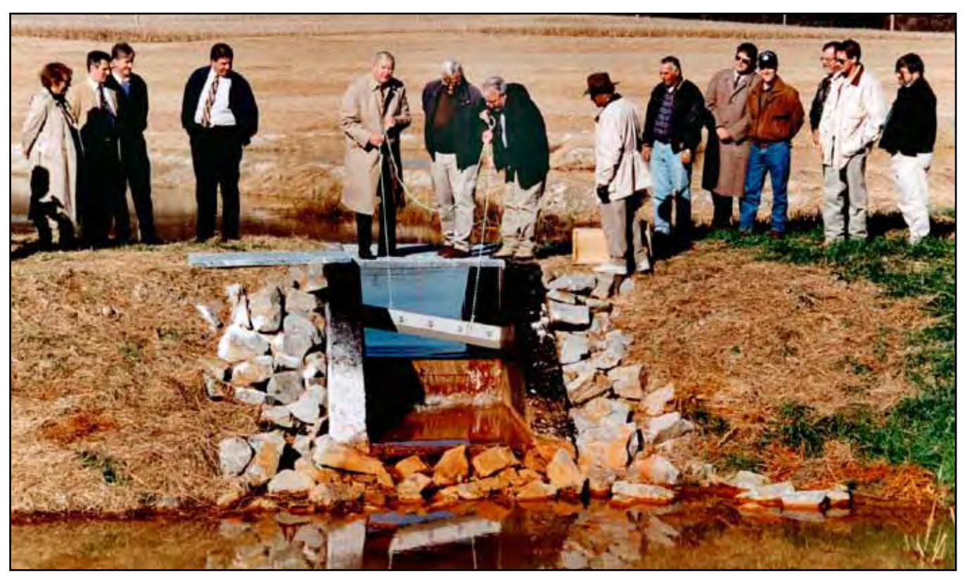
Saint Vincent passive treatment systems dedication near Latrobe