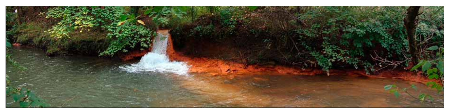
Phillips abandoned mine discharge